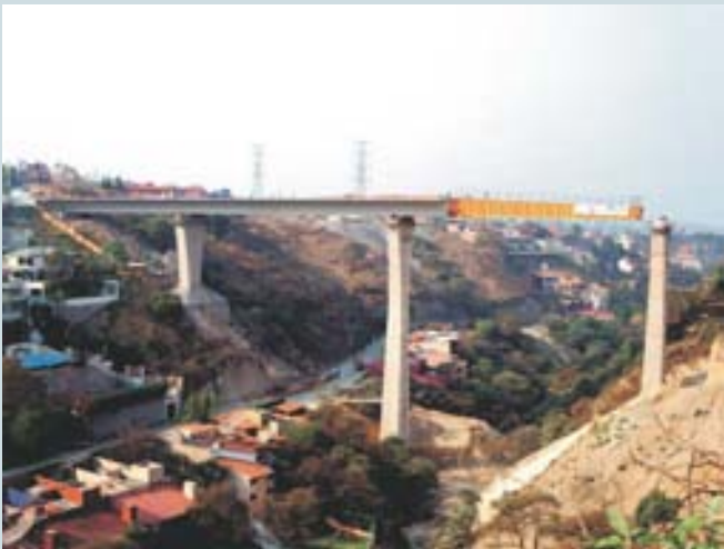
Huixquilucan Bridge, Mexico City