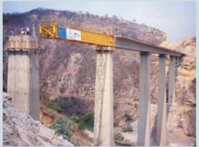
Atenquique I Bridge, Mexico