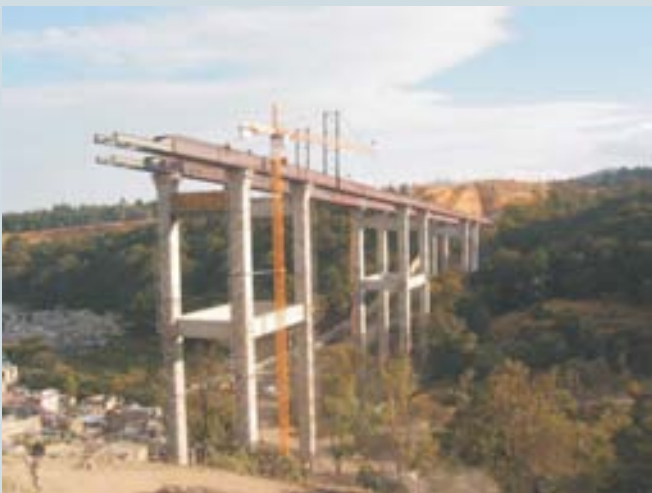
Carlos Pellicer Bridge, Mexico City