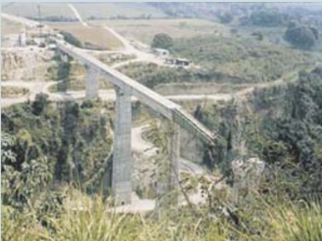
Atoyac Bridge, Mexico