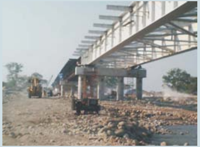
Martínez de la Torre Bridge, Mexico