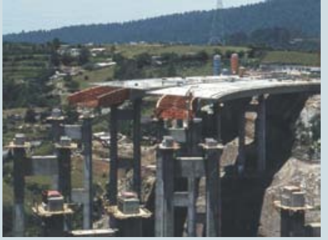
La Marquesa Bridge, Mexico City